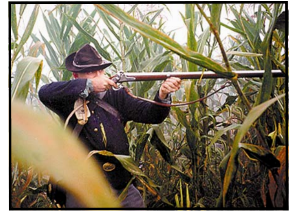
Action in the Cornfield during the 135th Commemoration of the Battle of Antietam.